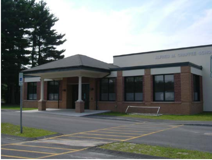
A.M. Chaffee School