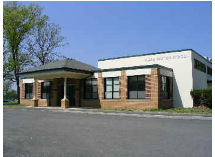
Clara Barton School